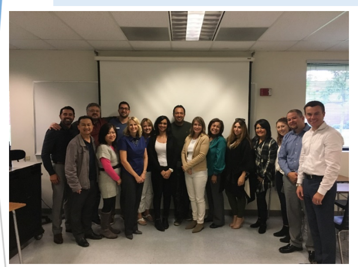
Pictured: IVC Guidance & Counseling

If you are not a member, please consider joining. Membership applications can be found under the 'Membership' tab on our FA website: <u>http://www.socccdfa.net/</u>