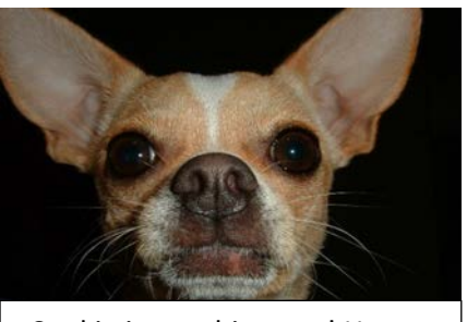
Cookie is watching you! Have a wonderful holiday season and be safe.

I would definitely go again if given the opportunity. In the future, I would like to continue attending different leadership opportunities offered by the CCA, if possible.